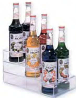
ITEM #: SBH3 Clear Acrylic, 3-Tier (Two-Wide) Flavored Syrup Bottle Holder