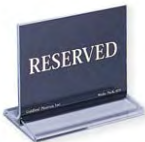
ITEM #: CMR "Reserved" Card and Menu Holder Combo

Our signs are durable, easy-to-read and ready-to-use so your customers don't have to take the time to create and print their own. Our "reserved" message sign comes in two convenient styles and sizes.