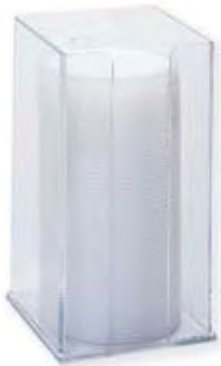
ITEM #: LDLG Single-Compartment – Large Cup and Lid Dispenser