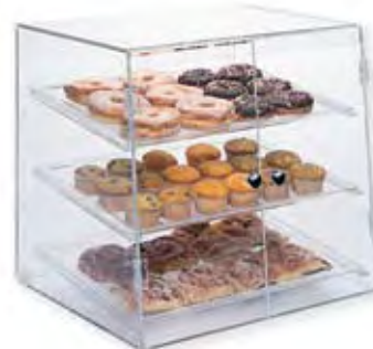
ITEM #: BDT3XSS Three-Tier Bakery Case (Self-Serve)

Replacement Tray: Item #TR1318 (available separately - see page 9)