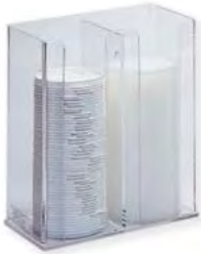
ITEM #: LD2 Two-Compartment – Cup and Lid Dispenser