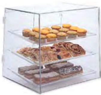
ITEM #: BDT3X Three-Tier Bakery Case (Counter-Serve)