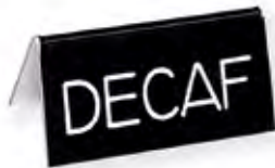
ITEM #: ENDEC "Decaf" Sign • black with white letters