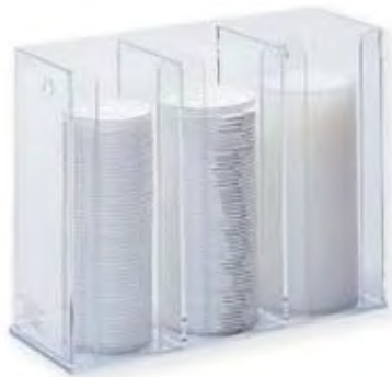
ITEM #: LD3 Three-Compartment – Cup and Lid Dispenser