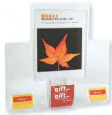
ITEM #: GCW3