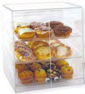
ITEM #: BDT3W Three-Tier Slant-Front Bakery Case (Self-Serve)

Replacement Tray: Item #TR1318 (available separately - see page 9)