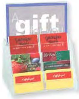
ITEM #: GC6

Gift cards are important cross-sell items to help improve profits, increase traffic and provide shopping convenience for customers. We offer a number of styles and options to maximize visibility and conserve valuable counter space.