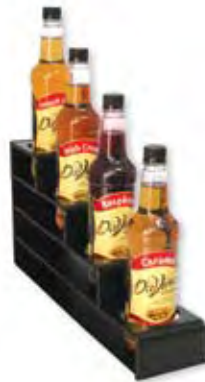
ITEM #: SBH4BLK Black, 4-Tier Flavored Syrup Bottle Display