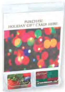
ITEM #: GCW2