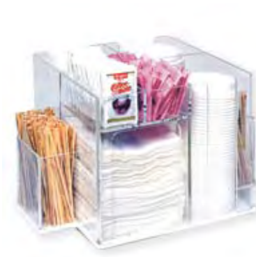
ITEM #: TC405 Condiment/Cup/Lid Center