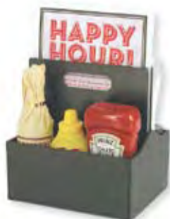
ITEM #: TC6PAK Six-Bottle Table Caddy