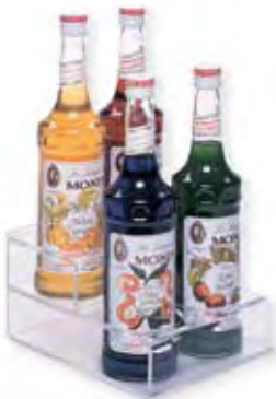
ITEM #: SBH2 Clear Acrylic, 2-Tier (Two-Wide) Flavored Syrup Bottle Holder