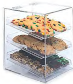
ITEM #: BDT3LB Three-Tier Lift-Back Bakery Case (Counter-Serve)

Replacement Tray: Item #TR1315 (available separately - see page 9)