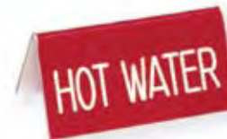
ITEM #: ENHOT "Hot Water" Sign • red with white letters