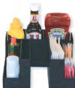
ITEM #: TCPATIO Patio Table Caddy