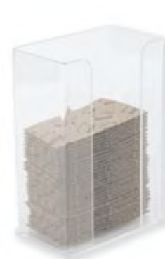
ITEM #: TC408 Coffee Cup Cozy Dispenser