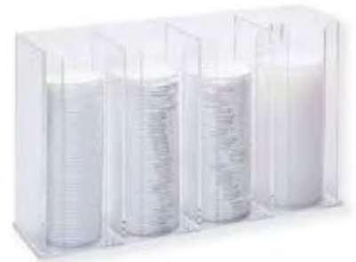
ITEM #: LD4 Four-Compartment – Cup and Lid Dispenser