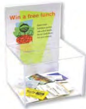
ITEM #: BBX88SH Ballot Box with Sign Holder

Great for free lunch drawings, selecting door prize winners or other special promos, the "ballot box" has many practical uses. It works especially well for patrons to drop in their business cards!