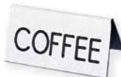
ITEM #: ENCOF "Coffee" Sign • white with black letters