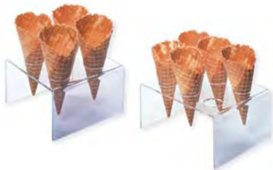
ITEM #: IC4 Four Ice Cream Cone Holder