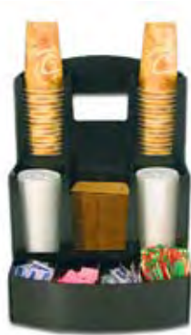
ITEM #: OGO03 Coffee Amenity Organizer