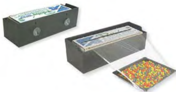
ITEM #: PWCSM Small – Plastic Wrap Case