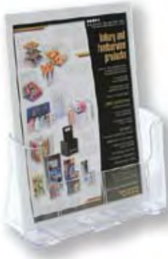
ITEM #: BH8511 8 1/2" Wide Brochure Holder

These countertop or wall-mounted holders are ideal for displaying informational brochures, promotional flyers, menu sheets and more. The clear acrylic styling fits any décor and will help keep materials well-organized and highly-visible.