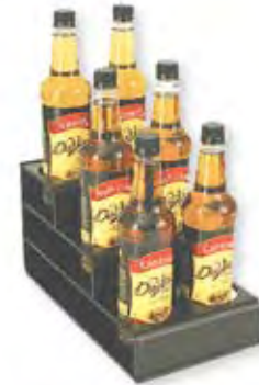
ITEM #: SBH3BLK Black, 3-Tier (Two-Wide) Flavored Syrup Bottle Display