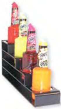
ITEM #: LBH4BLK Black, 4-Tier Liquor Bottle Display