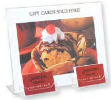
ITEM #: GCE2