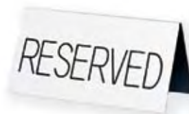
ITEM #: ENRESV Engraved Table Tent Sign "Reserved"